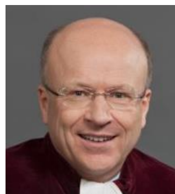
President European Court Koen Lenaerts