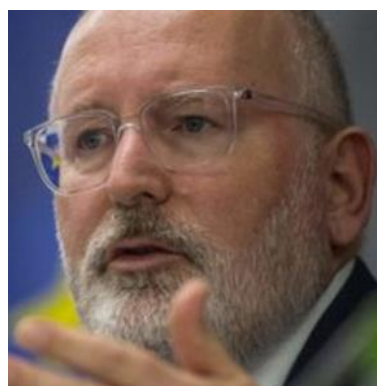
Commission Vice-president Frans Timmermans