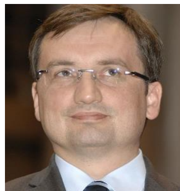
Minister of Justice Zbigniew Ziobro