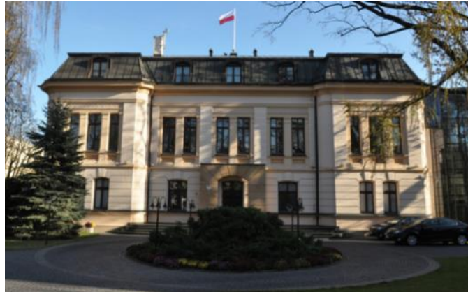
Poland's Constitutional Tribunal: 15 judges