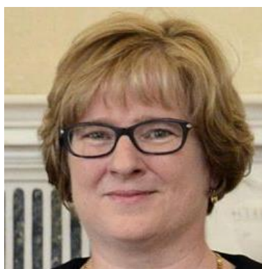
Irish High Court judge Aileen Donnelly