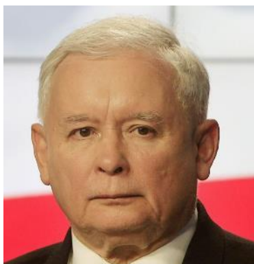
Party chairman (PiS) Jarosław Kaczyński